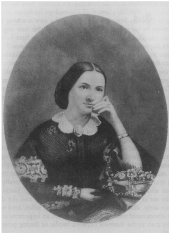
Augusta Jane Evans, author of Macaria; or, Altars of Sacrifice.

giving her father and her beloved beau Russell up to die on the battlefield and dedicating herself to the highest possible existence, laboring in “God’s great vineyard.” Married women, she admits, may be happier, but life was not made for happiness. It is the blessing—and macaria also means blessing in Greek—of the single woman to be more useful “because she belongs exclusively to no one, her heart expands to all her suffering fellow creatures.” For Irene, sacrifice becomes a vocation, not unlike that of the nun. And, indeed, Evans describes Irene abandoning fashionable garments for robes of black or white, tied at the waist by a tassel, suggesting that the analogy with the female religious is entirely self-conscious—for Evans as well as Irene. To her childhood friend, similarly bereaved by war, Irene declares, very much in the language of prevailing Confederate ideology,