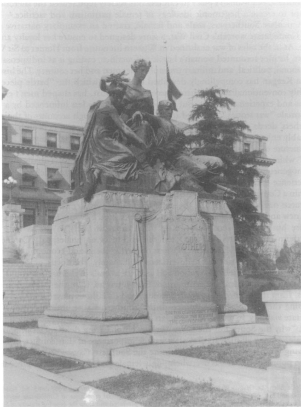
This monument to the women of the Confederacy was erected in front of the state capitol in Jackson, Mississippi, in 1904 by the United Confederate Veterans and the state of Mississippi at the cost of $20,000 and bears the inscription: "To Our Mothers, Our Wives, Our Daughters, Our Sisters."